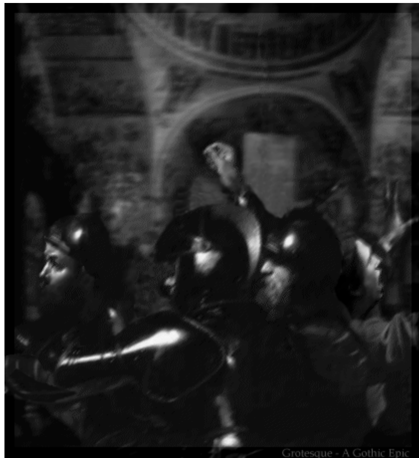
Grotesque - A Gothic Epic

Bourne turned and raked his blowing hair behind his ears. He marched toward his torchbearers. "Approach the hole with me! Shield your flames from the wind! Gather together and keep the torches lit, each flame lighting the next!" He neared the edge of the pit. In the faint illumination of leaning torch flames, he saw cracks forming in the pit walls and climbing upward and over the uppermost edge of hollow's perimeter. The fractures radiated from the gatestone, through the higher cathedral floor, even to spread beneath his boots. Bourne stepped back. Within the pit, the whirling funnel moaned, growing louder as it appeared to gain speed. Within its moan came the climbing tones of many screams that represented a massive gathering of unfathomable suffering – as if this were a roaring choir of a thousand tortured souls.